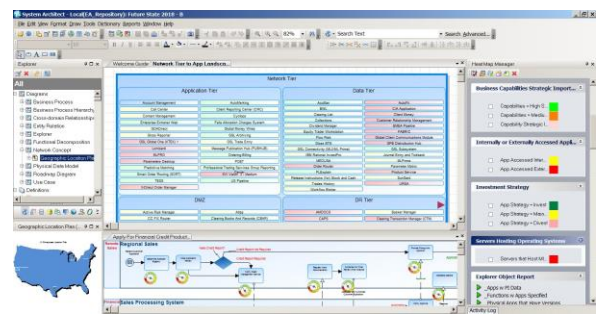
System Architect enables you to get a 360-degree view of the business, from Capability Maps to Business Processes, to landscape heatmaps to roadmaps.